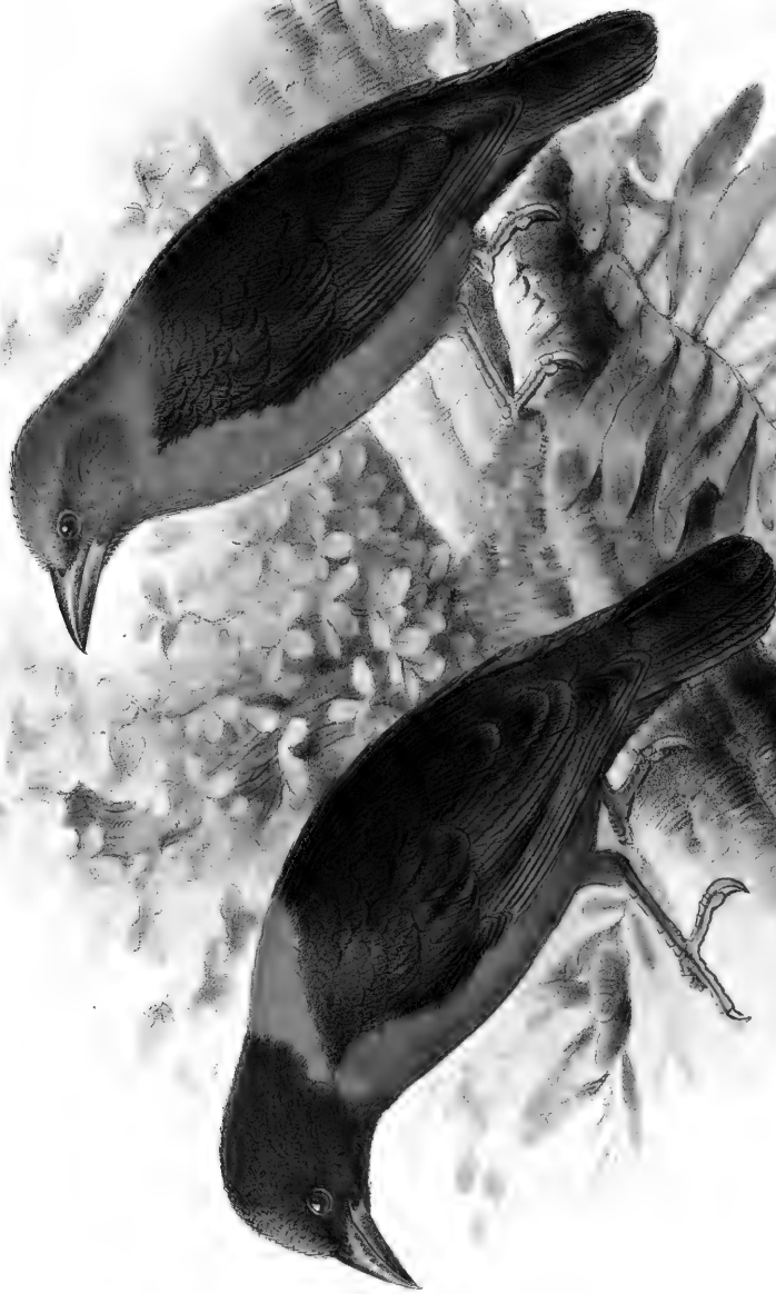
Cinnamopteryx tricolor , ad. & imm.